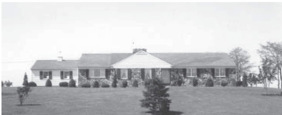
Home of Randall and Gladys, Newtown Square, PA, 1960-67