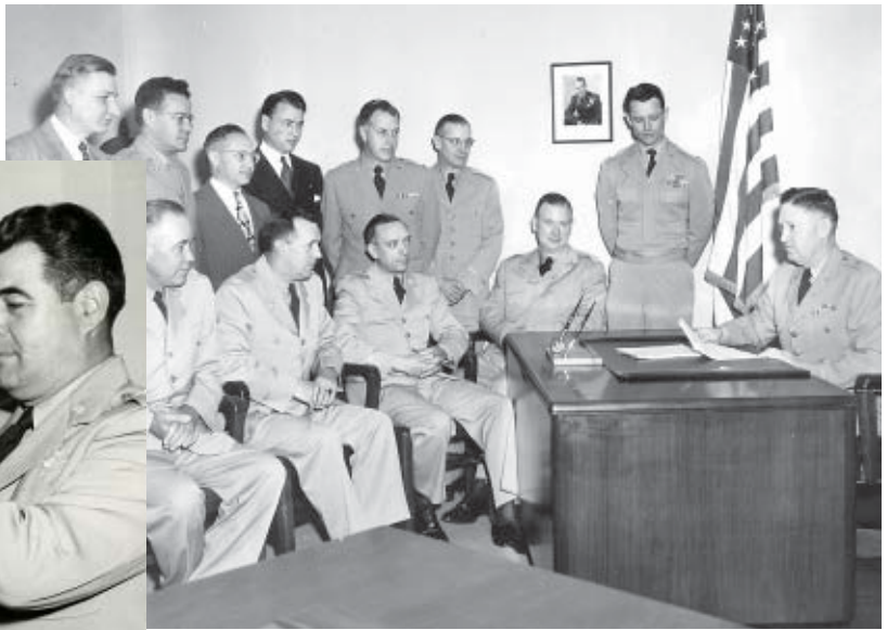
A Meeting of the Auditor General's Staff, 1951 (Right)