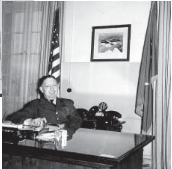
TRR As Comptroller, USAFE, Wiesbaden, Germany, 1954