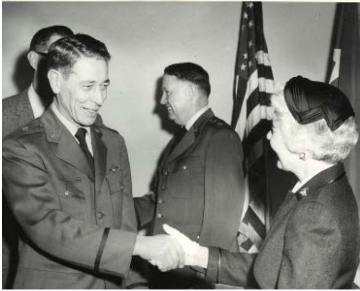
Air Force Retirement at the Pentagon, 1958