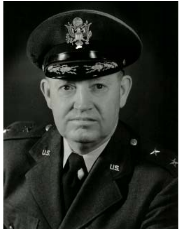
Second Star, September, 1952