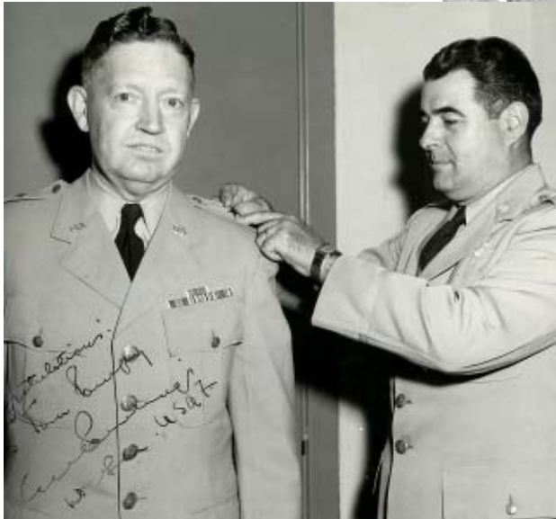
First Star, September, 1950