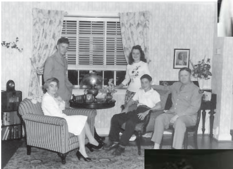
Just Married, November 11, 1944