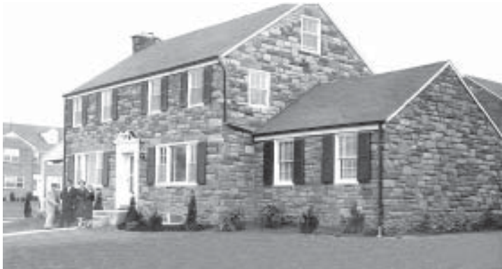
Home in Drexel Hill, PA, 1952