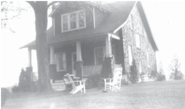
Maple Lane Farm, 1948-50