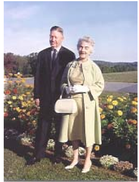
At Home in Newtown Square, PA, 1965